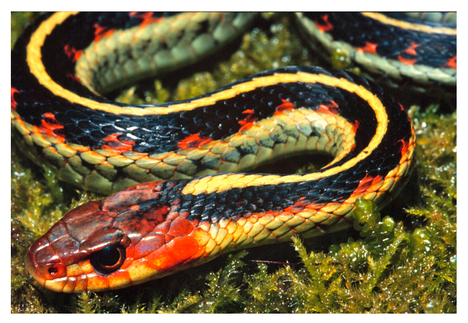
Figure 1. Picture of a common garter snake, Thamnophis sirtalis

Garter snakes are the most studied snake model system in the areas of ecology, evolution, behavior, and physiology. Not only is the breadth of work considerable, but the seminal nature of work in behavior genetics, development of personality, toxin resistance, pheromonal communication, and reproductive physiology places the genus Thamnophis among the major vertebrate models for organismal biology. Garter snakes have provided their most significant contributions as a model to investigate biological questions in the context of natural populations in the wild.